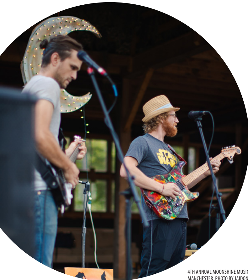
4TH ANNUAL MOONSHINE MUSIC FESTIVAL, MANCHESTER.

“For a community of our size and area, we are fortunate to have the variety and dynamism that we do. It’s an important, and often overlooked, aspect to quality of life here.”