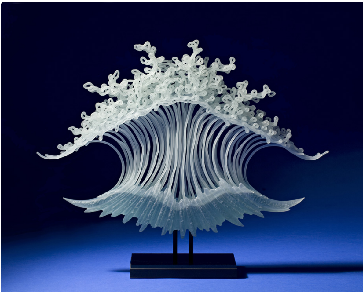
CARVED GLASS SCULPTURE BY K. WILLIAM LEQUIER, READSBORO GLASSWORKS, READSBORO.