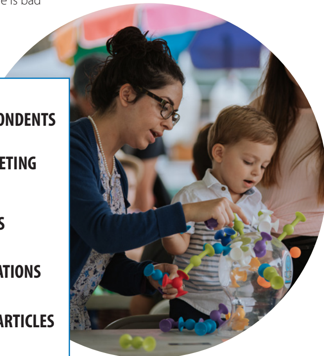
GARLIC FEST, BENNINGTON.

540 SURVEY RESPONDENTS 43 FEEDBACK MEETING ATTENDEES 60 INTERVIEWEES 49 MEETING LOCATIONS 34 DOCUMENTS/ARTICLES 17 REGIONAL REPORTS