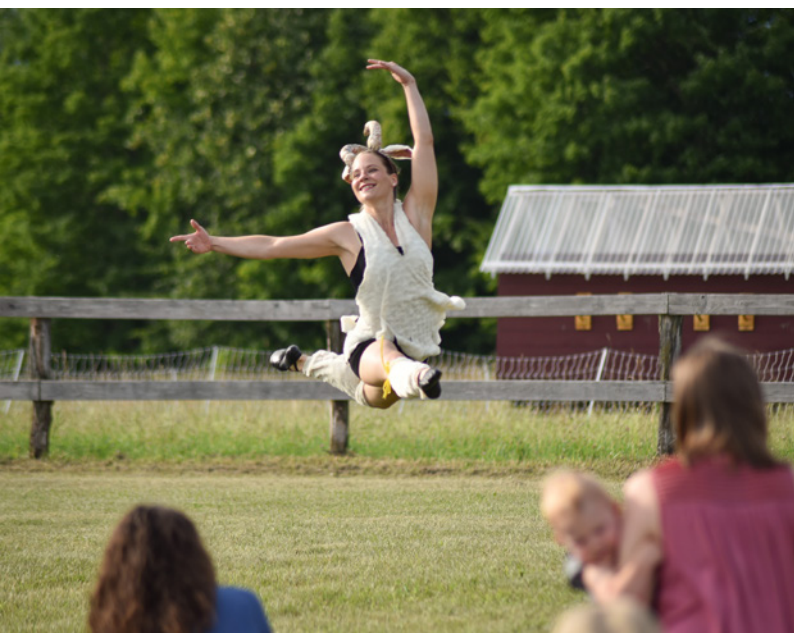
FARM TO BALLET AT STUDIO HILL FARM, SHAFTSBURY.