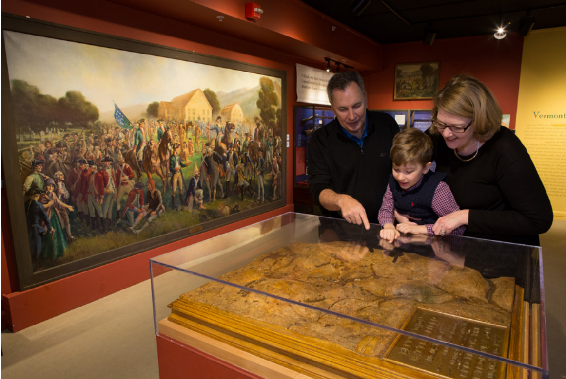
MILITARY GALLERY, BENNINGTON MUSEUM, BENNINGTON.